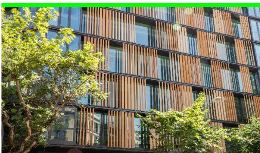
New Campus 2 (Provença 216)

EADA Business School Barcelona was founded in 1957 by a group of entrepreneurs and professionals as an ideologically and economically independent institution. As well as appearing in the international rankings of well-known publications such as the Financial Times or The Economist, as one of the top 100 business schools in the world, it holds the EQUIS accreditation from the EFMD (European Foundation for Management Development) and the AMBA which recognises the quality of MBA programmes.